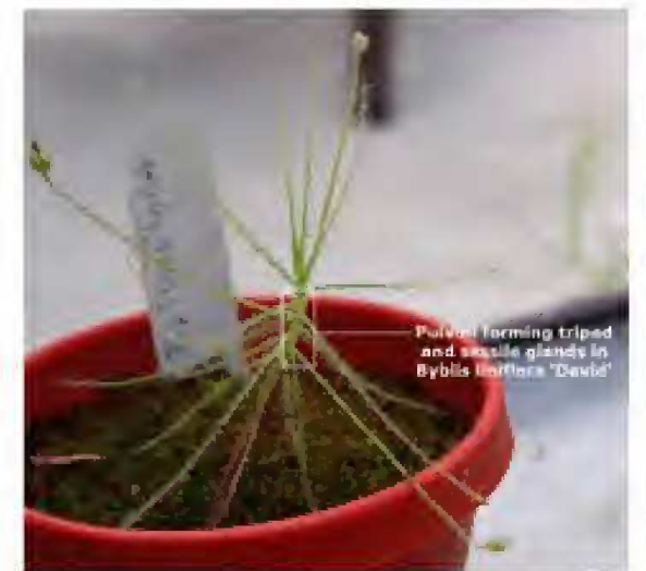
Figure 12: Byblis liniflora 'David' pulvini and sessile glands.

I purchased seed labeled Byblis liniflora from Rare Exotic Seeds on 12 February 2009. I soon discovered that the resulting plants possessed the same pulvinus anomaly that was first documented by Byblis filifolia 'Goliath' in 2008. However, this marvelous cultivar is much smaller (to 20 cm tall) and forms pulvinus on the leaf axils as well as the pedicels. Interestingly, pulvinus formation is unconditional and the leaves move downward to form a tripod-like support for the plant (see Figure 12). Another distinguishing factor is the existence of sessile glands on the shoot apex and leaves (see Figure 13). Branching is rare but does occur.